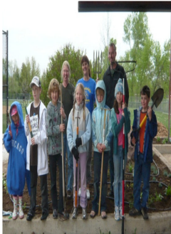
( http://content.chf2.com.s3.amazonaws.com/article-1306105895-MAGarden.JPG )

Smiles abound during the Saturday morning event!