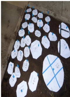
( http://content.chf2.com.s3.amazonaws.com/1306105897-MAGarden2.JPG )

Smiles abound during the Saturday morning event!