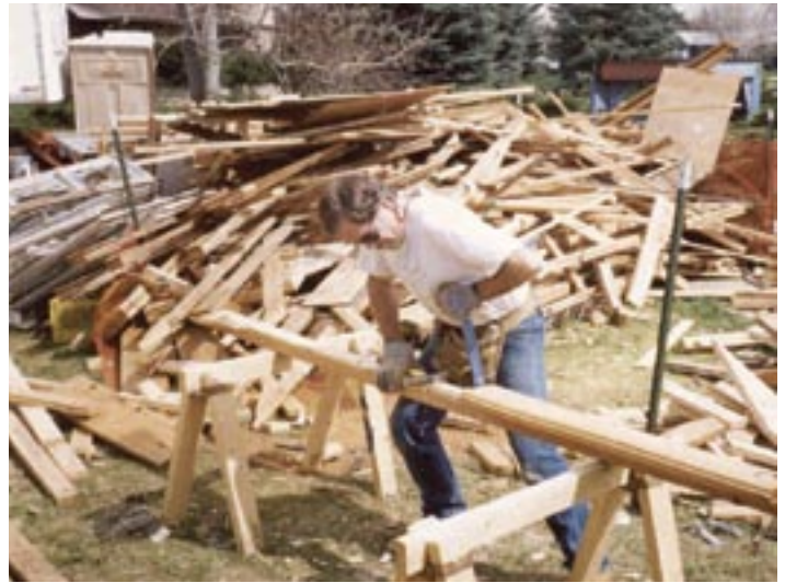
Manual denailing at a deconstruction project.

For more information about deconstruction, or to schedule a site visit, call 303-419-5427.