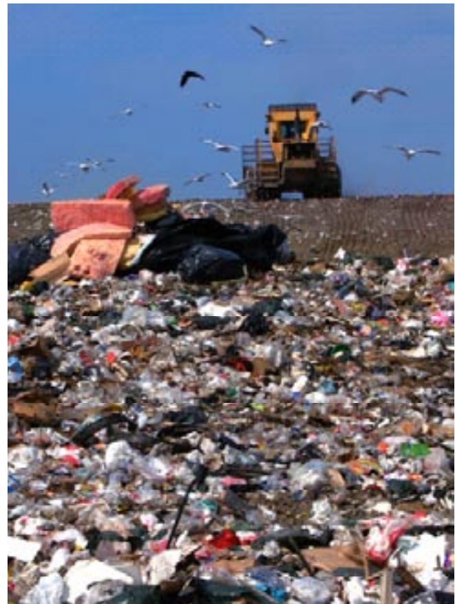
Tons of waste can be diverted from landfills by deconstructing

Finally, the environmental impacts of deconstruction are astounding. According to statistics from the U.S. Energy Information Administration, the largest single contributor to global warming is the building industry. All together the energy necessary to operate industrial, commercial, and residential buildings, as well as the energy needed to produce all the materials that go into the creation